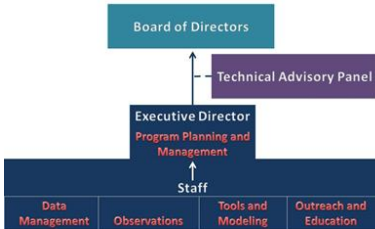
FIGURE 1: Organizational Structure